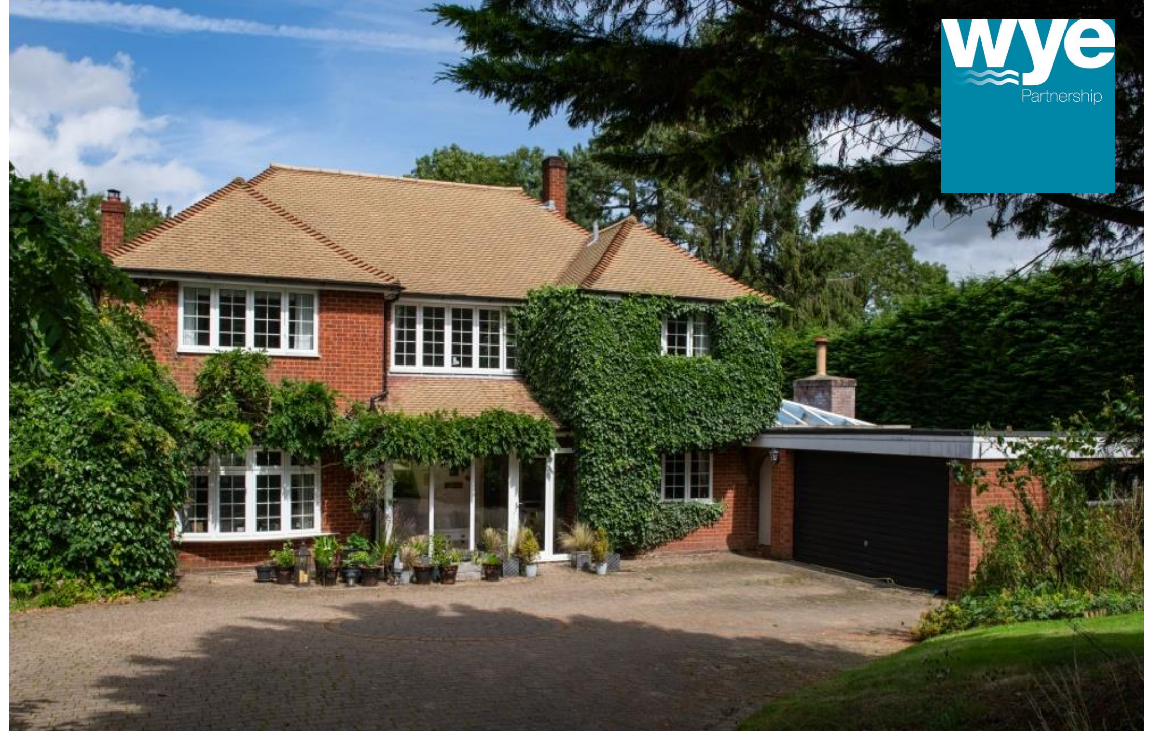
Woodland House, Great Missenden, Buckinghamshire, HP16 9LJ